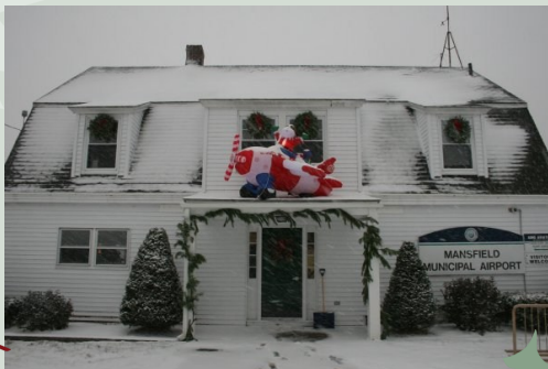
December 2009. Santa got destroyed that winter.

Meet the Staff at our Annual Holiday Open House on Saturday December 18th from 1-3 pm. Bring your favorite snack or baked good!